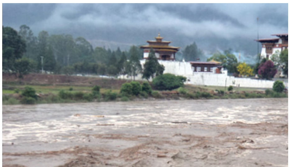
GLOF Flood in Punakha, Bhutan

Glacial Lake Outburst Flood (GLOF) is a type of flood occurring when water dammed by a glacier or a moraine is released. When glaciers melt, they sometimes form lakes on mountaintops